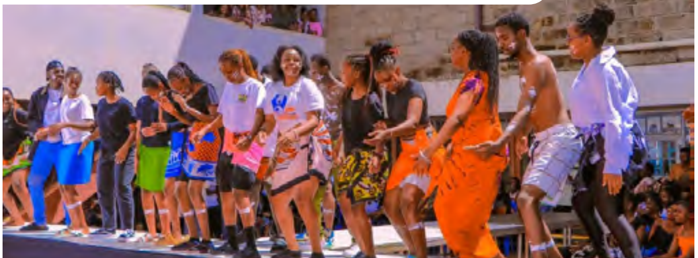
KMTC Meru students perform a cultural dance during the Campus Cultural day.

Mbuvo Campus students participated in a skills development training facilitated by BrighterMonday, courtesy of the Anita Mbinya Foundation (AMF). The training aimed to enhance employability through soft skills, entrepreneurship, networking, and CV writing, with all participants receiving certificates at the end of the session.