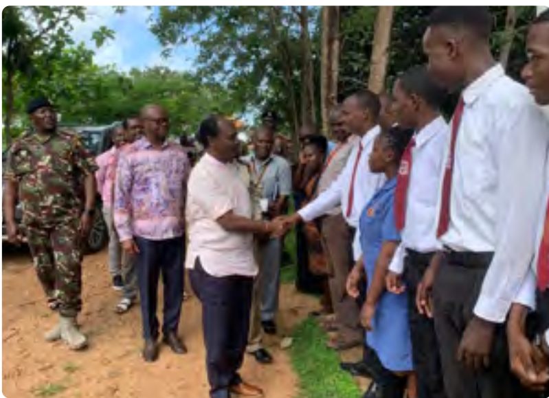
Cabinet Secretary for Information, Communications, and the Digital Economy, Hon. William Kabogo, visited Msambweni Campus on June 12, 2025, as part of his tour of public institutions connected to government internet. During the visit, he pledged to improve network connectivity and support the campus with additional computers.