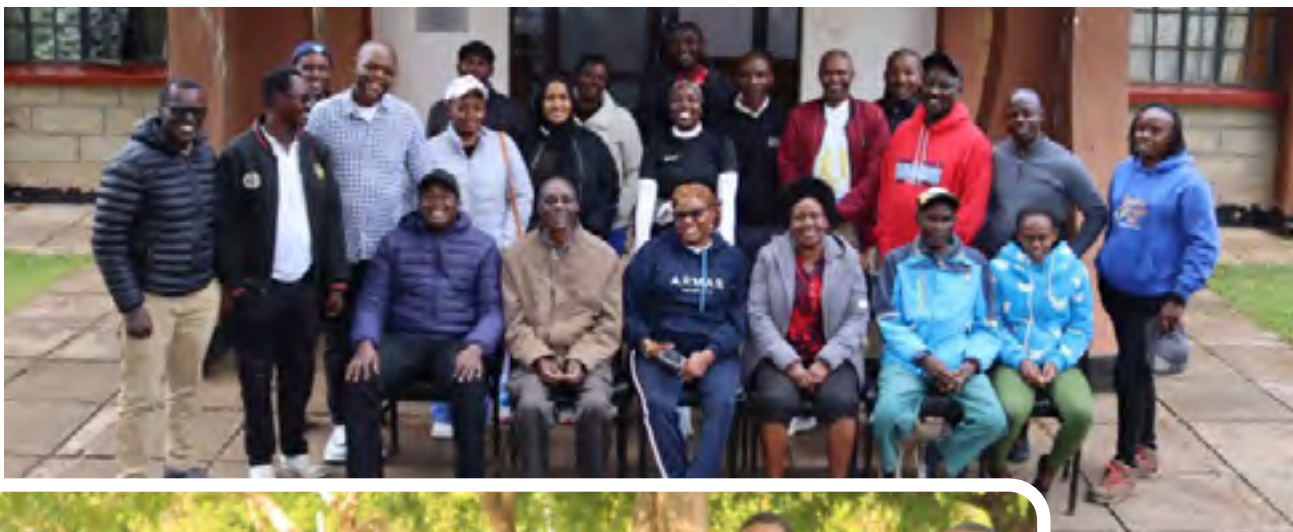
Isiolo Campus Staff during a team building on June 21, 2025.