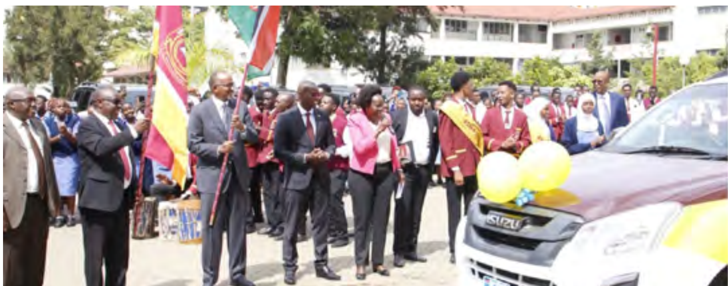
CS Duale flags off vehicles to support teaching and learning at Lamu, Chwele, Bungoma, Mathari, Iten, Ndhiwa and Chuka campuses.