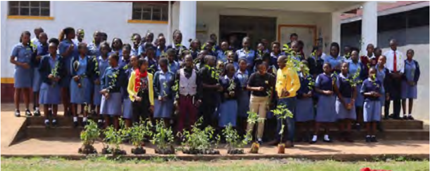
Chwele and Bungoma Campuses.