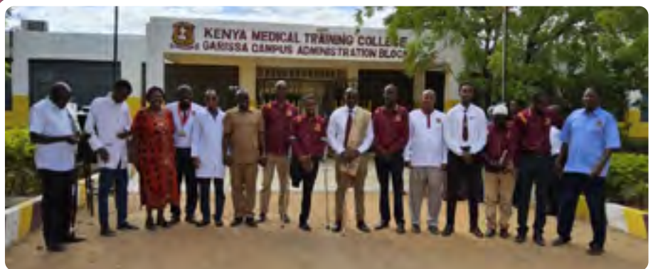
The Board Directors, Management and Staff at Garissa Campus.

He also proposed collaboration in launching Higher National Diploma programmes in key areas like Renal Nursing and Critical Care Nursing, which are essential for advancing local healthcare services.