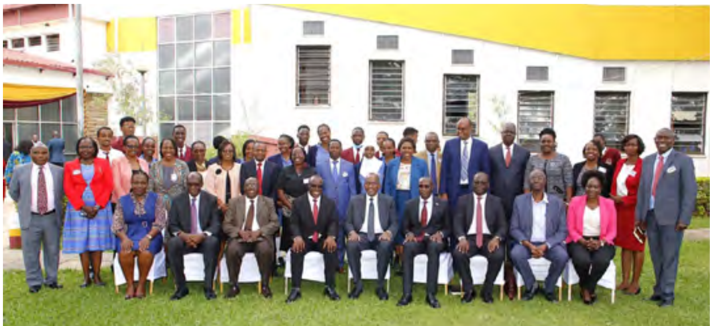
A section of Guests, Board Directors, Management, Staff and Students during the 8 th Scientific Conference.