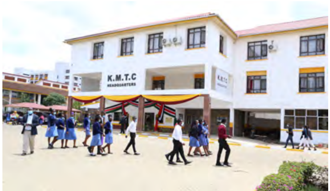
A section of students at the KMTC headquarters.

K MTC has received a major boost following the release of Kshs. 500 million by the National Treasury to support financially needy students through the Higher Education Loans Board (HELB).