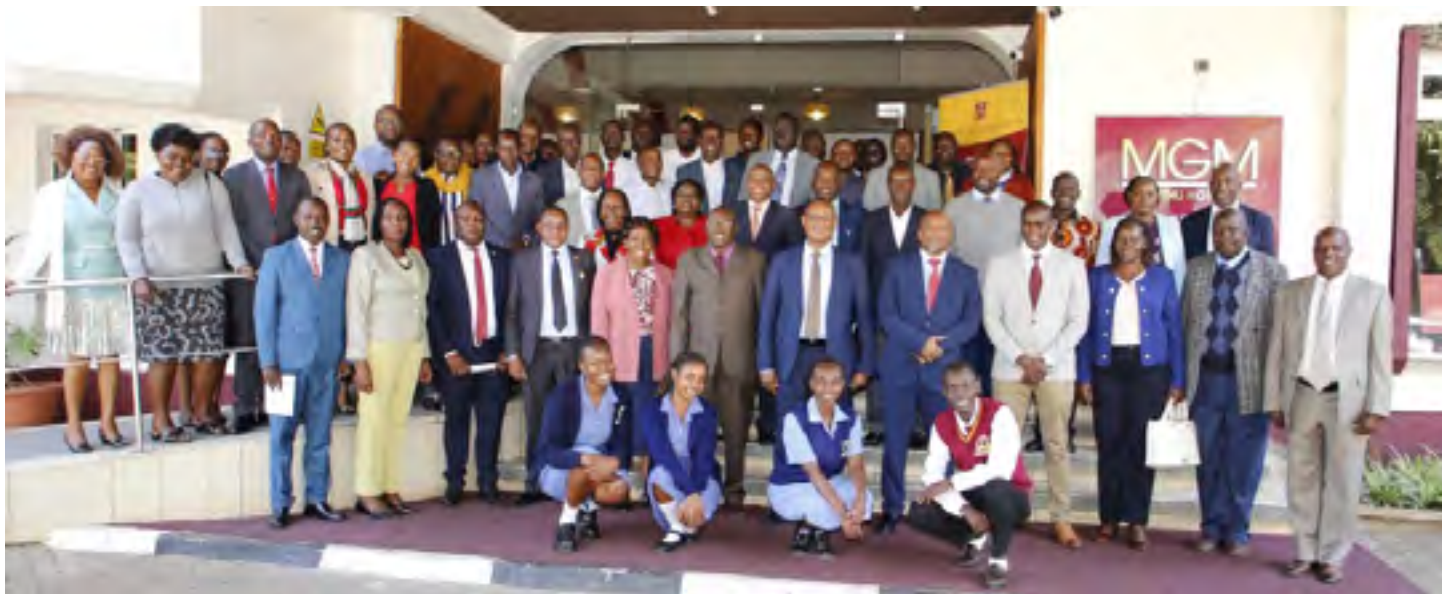
KMTCC Board Directors, Management, Alumni, Staff, students and guests during the event.

Leaders, alumni, and supporters from across the KMTCC community gathered in Nairobi on 27 th June, 2025, for the College Alumni Fundraising Breakfast. This event was dedicated to supporting needy students facing financial barriers in their medical training.