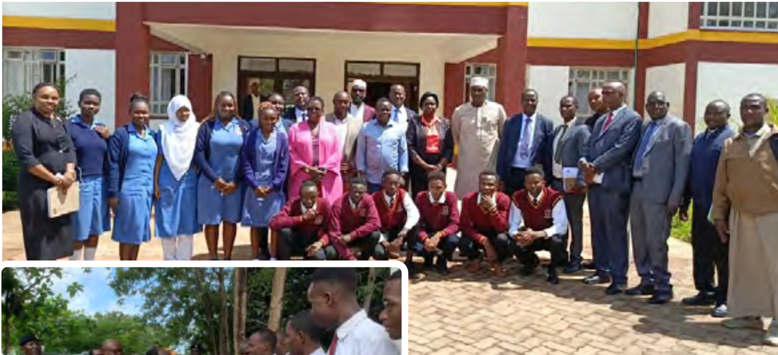
Marsabit Campus hosted the Senate Committee on Roads and Housing on June 27, 2025 during an oversight visit, where the Senators also took time to encourage and interact with students.