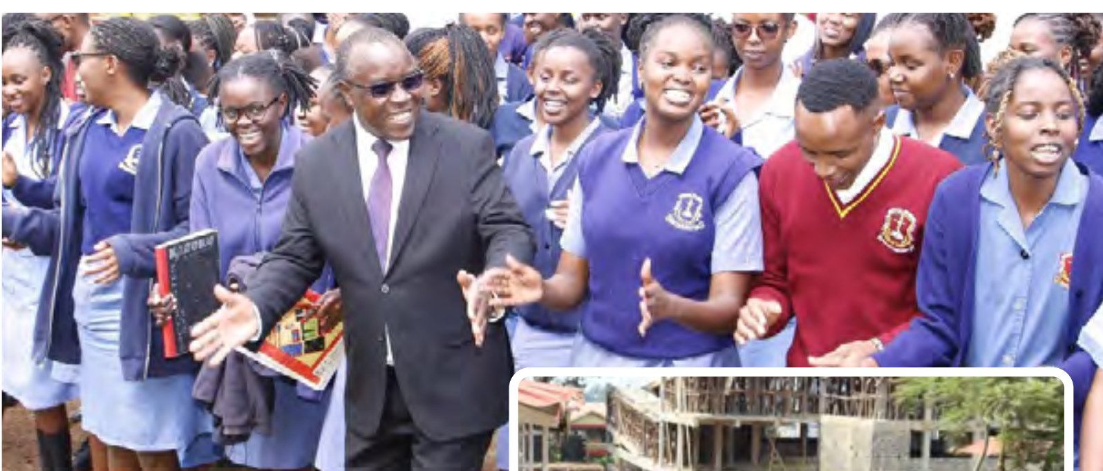
Board Chairperson welcomed to Karuri Campus by the Students.