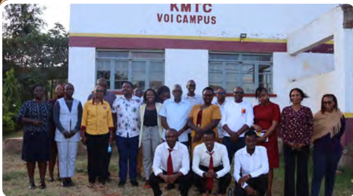
Voi Constituency MP Hon. Jones Mlwa visited KMTC Voi Campus on June 12, 2025 to discuss infrastructure needs. He announced plans to formalize an MoU with the State Department of Housing for the construction of a modern student hostel.