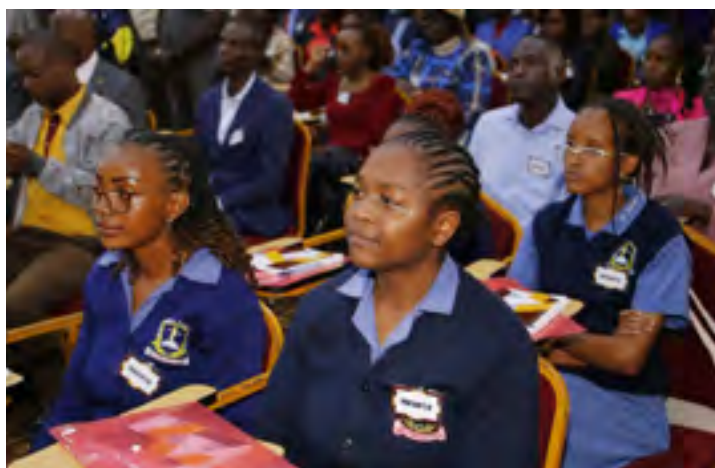
A section of participants during the conference.