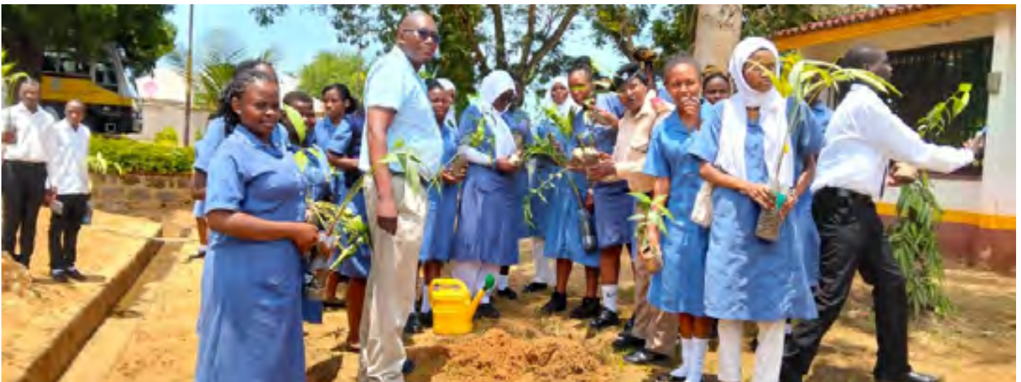
Port Reitz Campus.