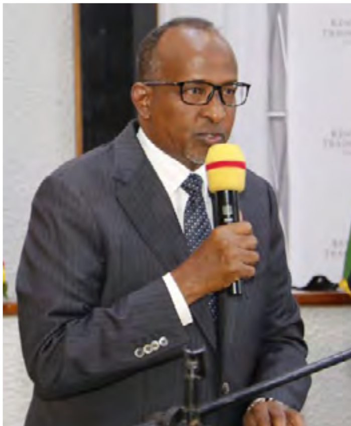
Health CS Hon. Aden Duale speaking during the official opening of the 8 th Scientific conference.

H ealth Cabinet Secretary Hon. Aden Duale has assured the College students that the government is committed to unlocking Kshs. 500 million allocated to support financially needy learners.